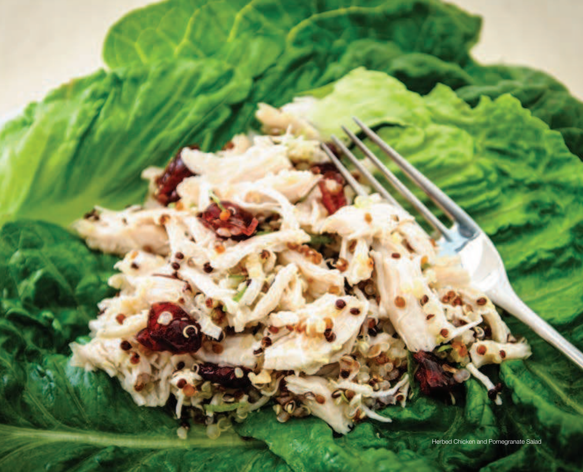
Herbed Chicken and Pomegranate Salad