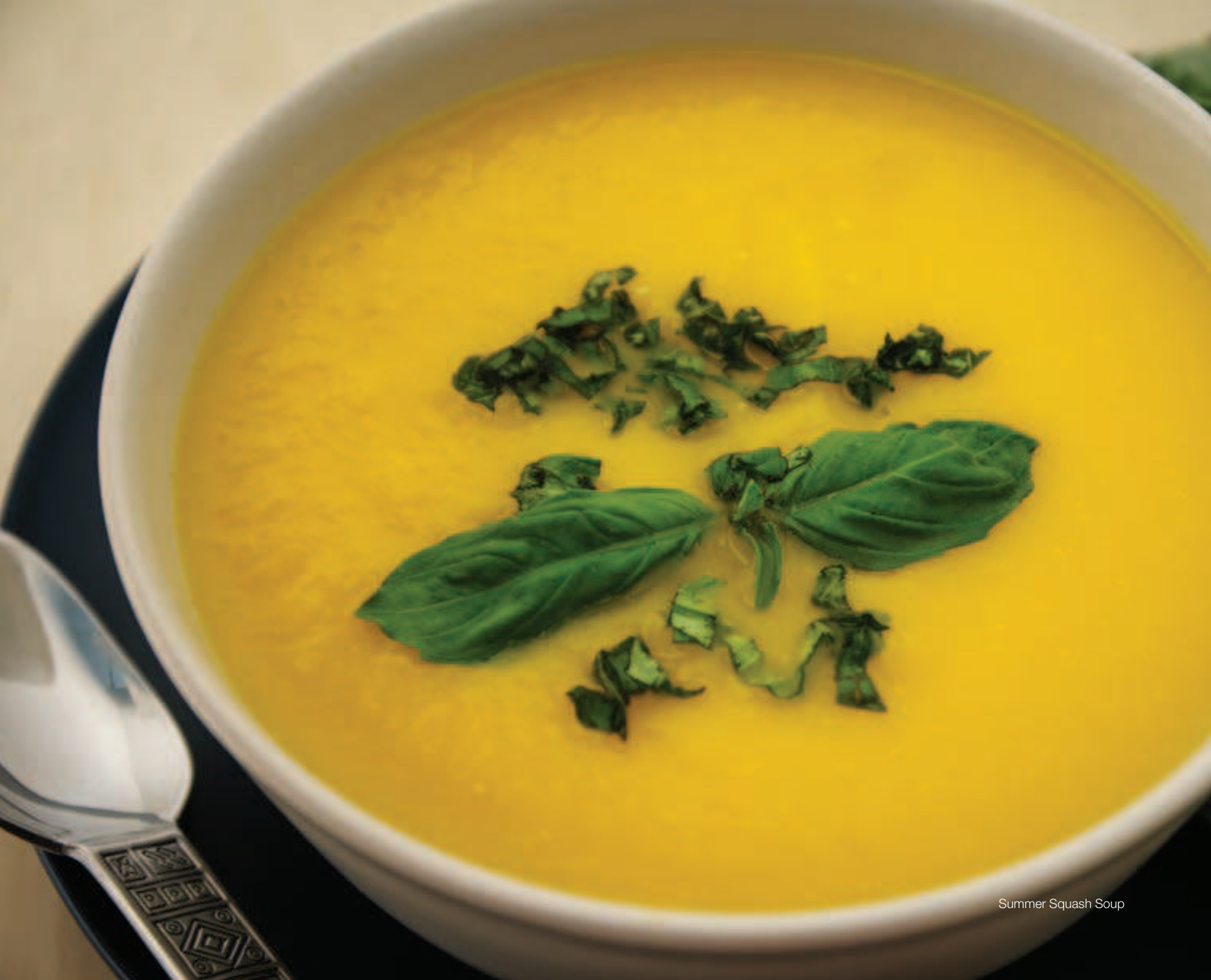
Summer Squash Soup