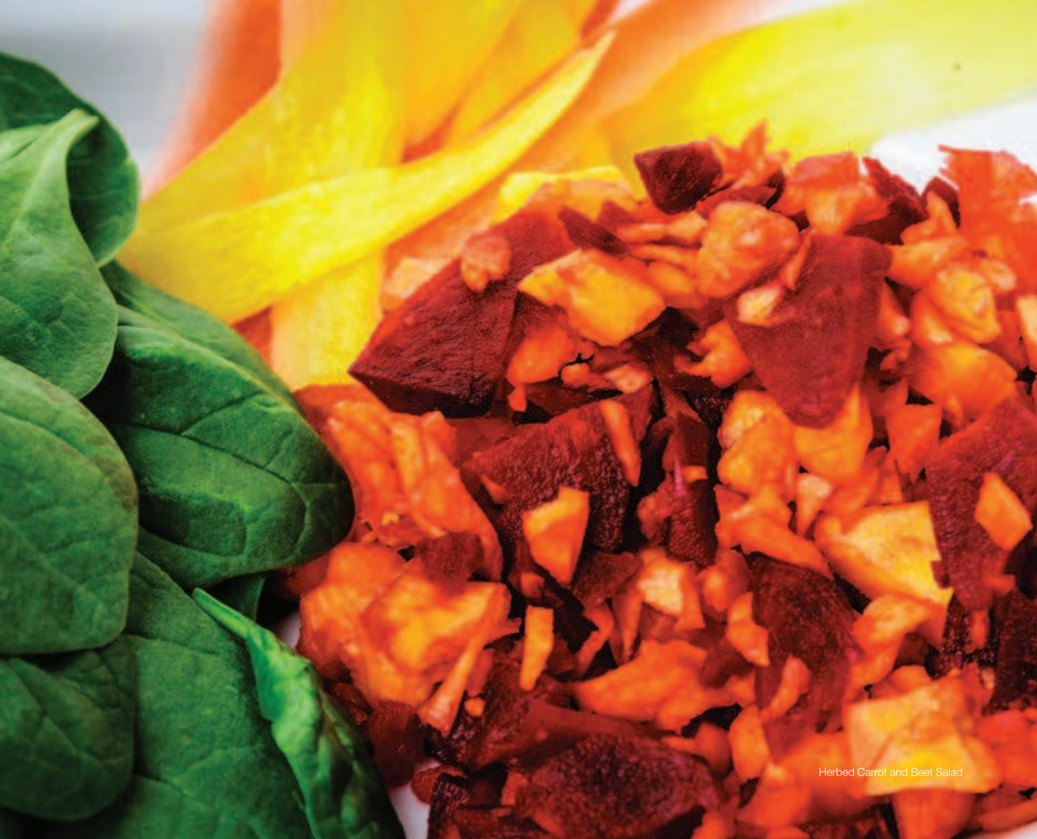
Herbed Carrot and Beet Salad