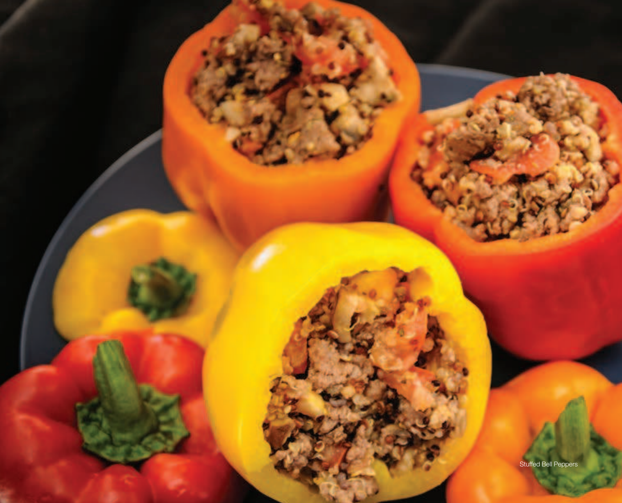
Stuffed Bell Peppers